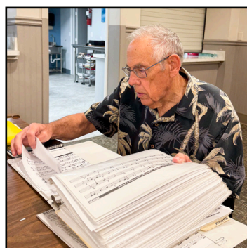
Art and the band's tune book