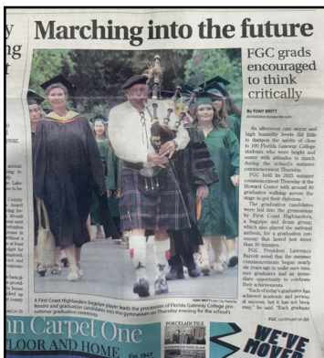
Art in the Lake City Reporter