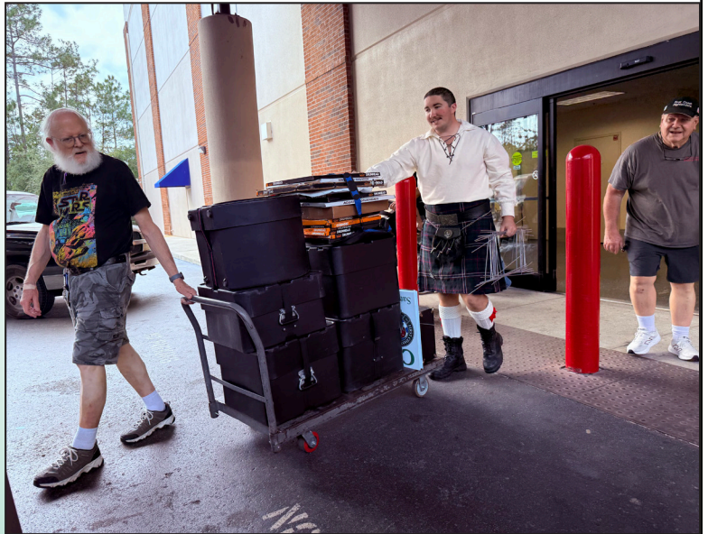
Moving Day for all of the band’s equipment