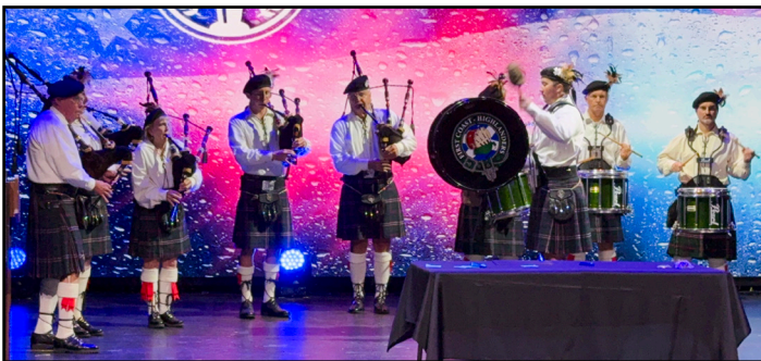
Florida Gateway College EMS Graduation, December 2025