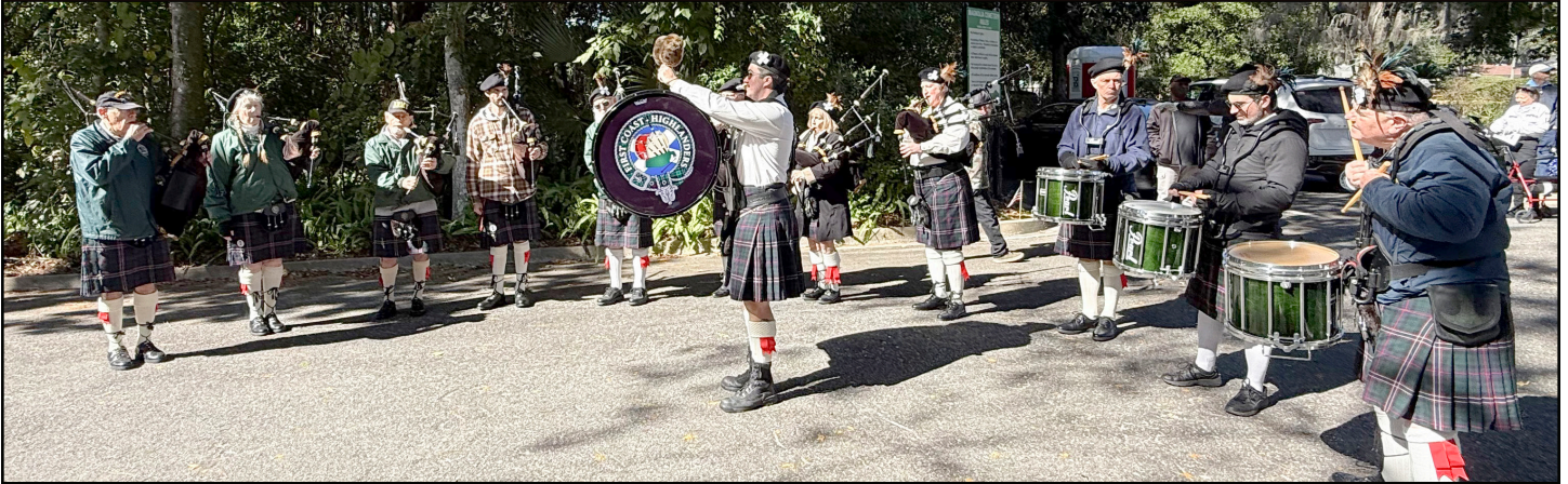
Veterans Day at Magnolia Cemetery, November 2025