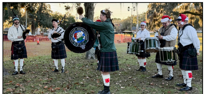
Cocoa and Carols, December 2025