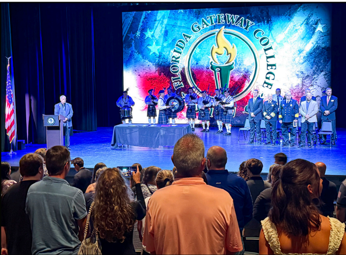
EMT & Firefighters Graduation at Florida Gateway College