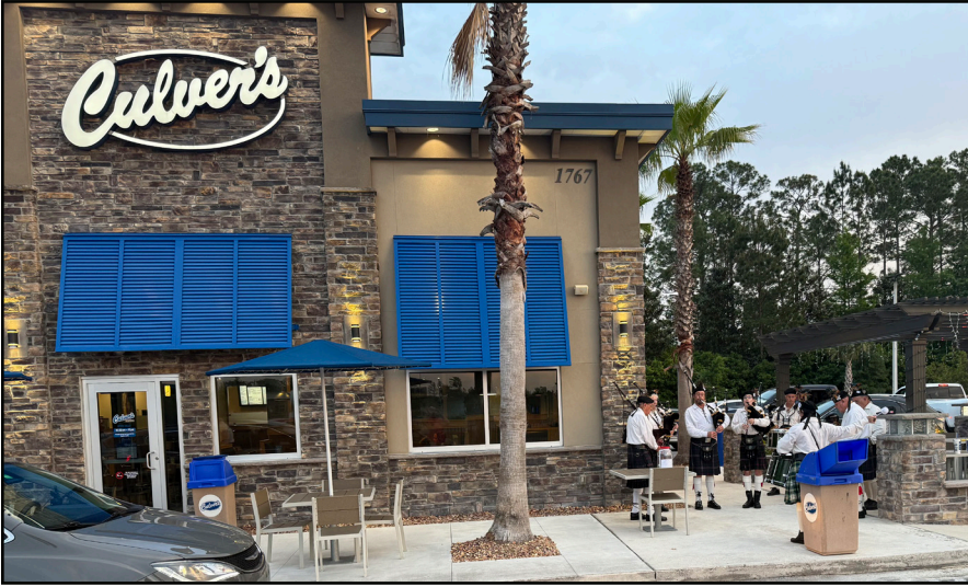
FCH members have played at Culver's Donate While You Dine events in Middleburg and Jacksonville ~~ we appreciate Culver's support!