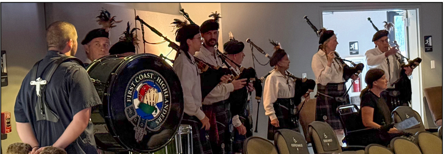
Clay County Fire Rescue Promotion Ceremony