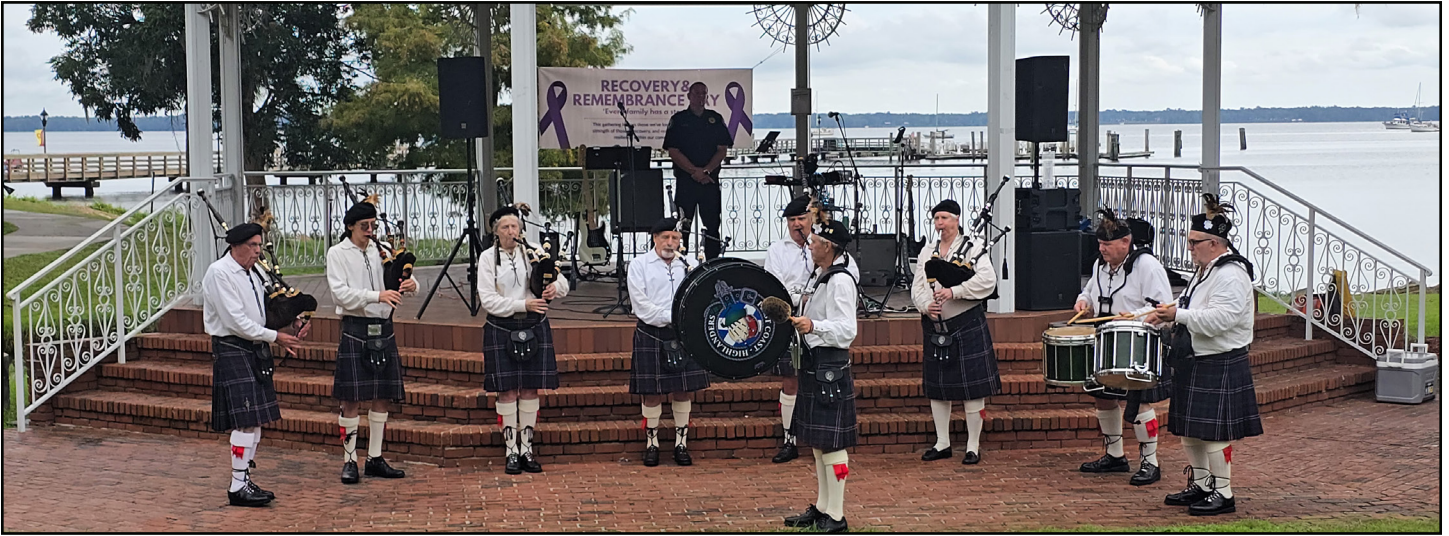
Recovery & Remembrance event, Green Cove Springs