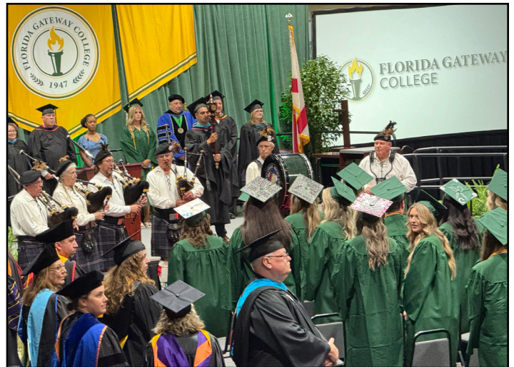
Florida Gateway College Graduation