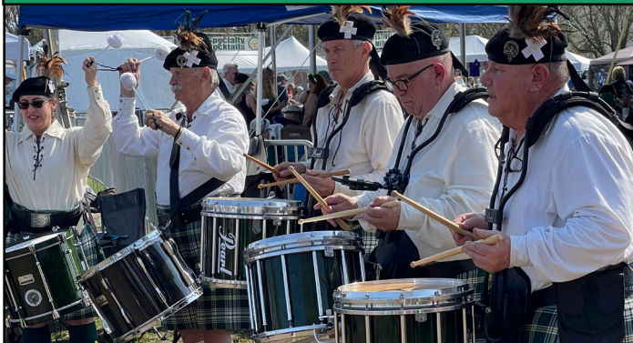
Drummers at the St. Augustine Celtic Festival