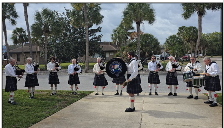
Playing outside St. Giles Presbyterian Church following a Kirkin o' the Tartan