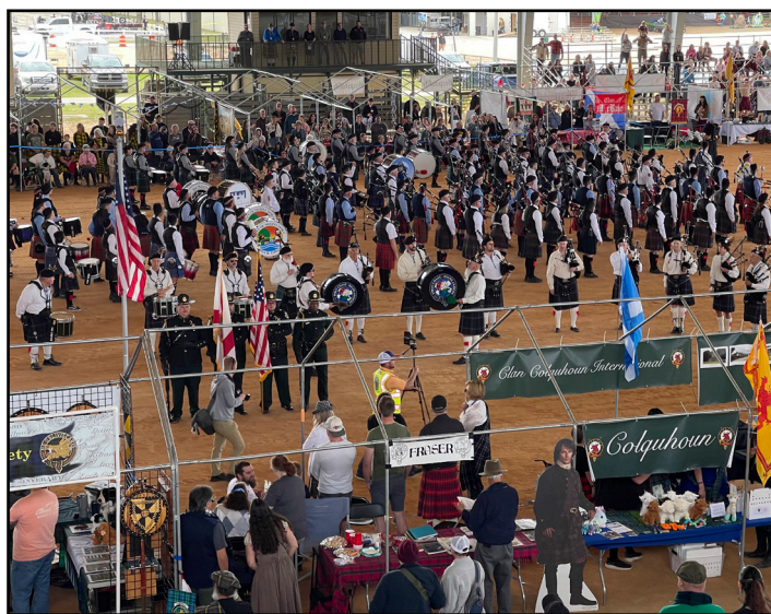
Playing the Star Spangled Banner, with massed bands on the field at the Northeast Florida Scottish Games and Festival