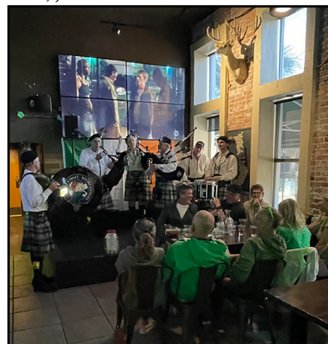
St. Patrick's Day celebration at The Lodge Ocala