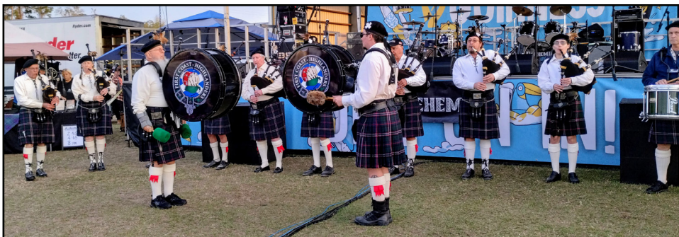
At the night stage, Northeast Florida Scottish Games and Festival