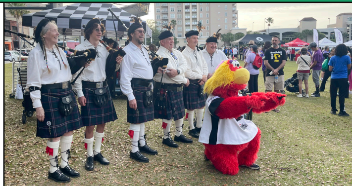
Fun at the Stand Up & Stride for Domestic Violence Awareness Walk, Jacksonville