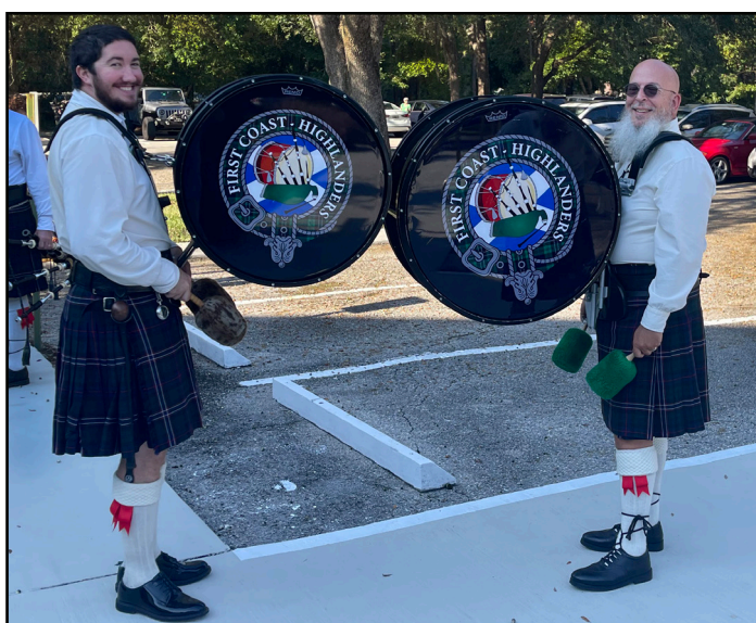
Dualing bass drums