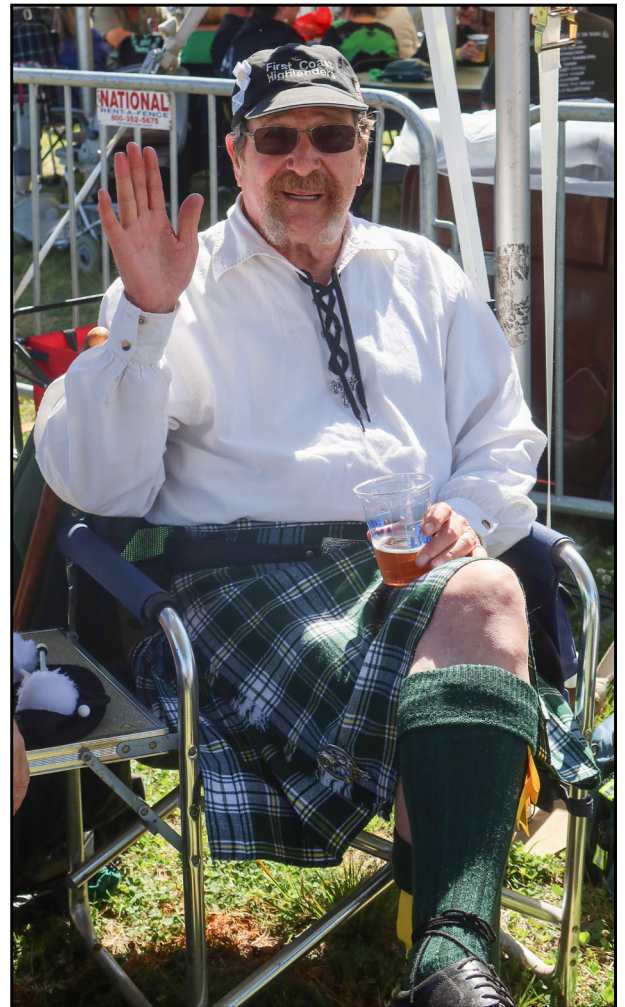
At the St. Augustine Celtic Festival, 2023

January 10th Ron Parker Memorial (11:00 AM) Ron Parker Park, St. Augustine Beach January 26th Kirkin of the Tartan (8:30 & 10:30 AM) St. Simons Presbyterian Church, St. Simons Island, GA February 16th Kirkin of the Tartan (10:00 AM) St. Giles Presbyterian Church, Orange Park February 22nd NE Florida Scottish Games (9:00 AM) Clay County Fairgrounds March 8th-9th St. Augustine Celtic Festival (9:00 AM, All Day, Both Days) St. Francis Field, St. Augustine March 16th St. Patrick Mass & Joe Paddy Festival (11:00 AM) St. John Paul II Catholic Church, Ponte Vedra Beach May 25th Memorial Day Church Service (10:30 AM) Turning Point at Calvary Church, St. Augustine