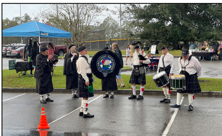
Playing in the rain for the Veterans Day 5K run at Oakleaf Community Park