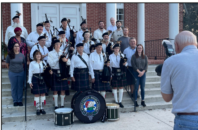
Posing for the annual band photo