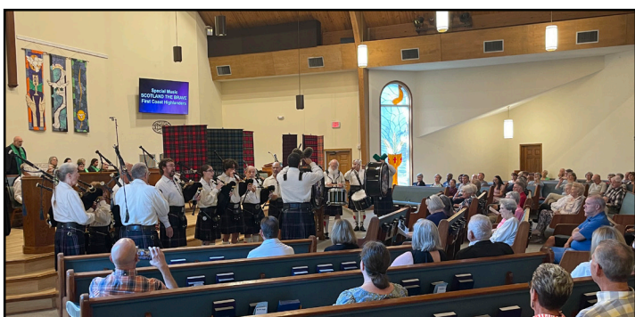
Kirkin o' the Tartan, Geneva Presbyterian Church