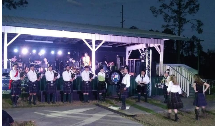
The last weekend in February performed at the North Florida Highland games at the Clay County Fair Grounds Parading of the Clans at the Highland Games The final concert for the day