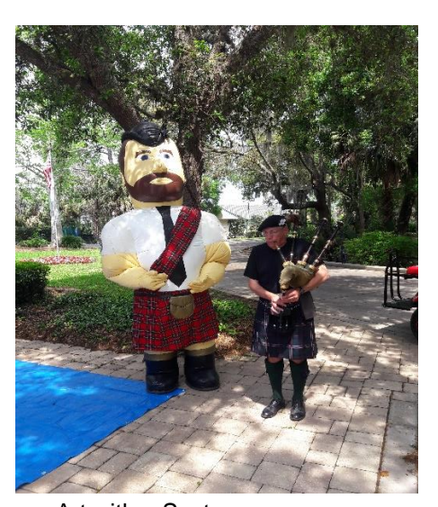
Art with a Scotsman Marsh Landing, NF Highland Games Golf Tournament