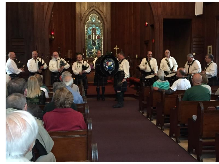
A great way to end St. Patrick's Day with Vespers at St. Cyprian's Episcopal Church