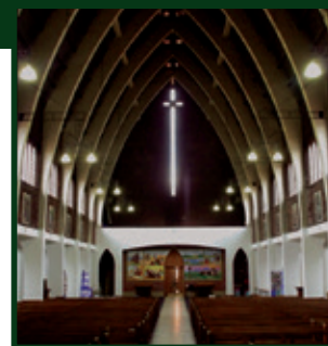
Highland Cathedral, Saint Columba Church of Scotland