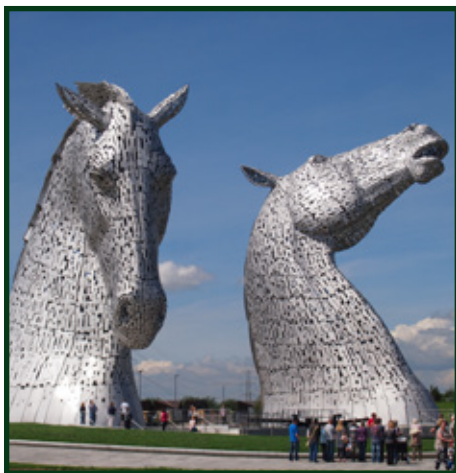
Kelpies in Falkirk, Scotland

To find out more about the Kelpie Water Horse visit www.scotclans.com/scotland/scottish-myths/scottish-monsters/kelpie .