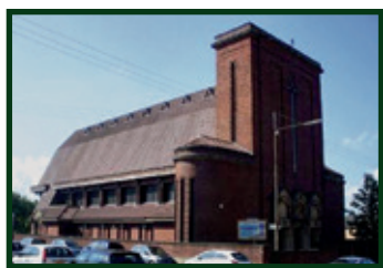
Saint Columba Church of Scotland, Glasgow

This tune has become so popular it has been proposed as the Scottish national anthem to replace the unofficial anthems