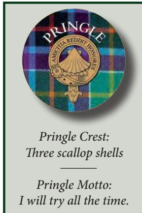
Pringle Crest: Three scallop shells

If you have Scottish heritage and can tell a story about what you know of your clan and sir-name, write it up and submit to The Clay Piper editor Bob Simpson, piper4fch@comcast.net .