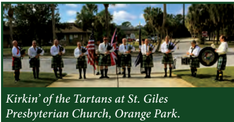
Kirkin' of the Tartans at St. Giles Presbyterian Church, Orange Park.