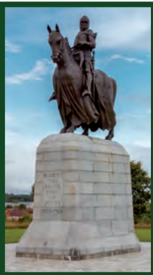
Robert the Bruce statue, at the monument for the Battle of Bannockburn.

In the year 1306 King Robert I ("The Bruce") was crowned at Scone. Bruce was crowned by Bishop William de Lamberton in front of the banner of the kings of Scotland, wearing royal robes which had been hidden from the English.