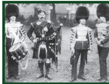
Scots Guards drummer, piper, bugler and bandsman, circa 1891.

In the year 1642, The Scots Guards Regiment was formed when King Charles I issued a commission to the Marquess of Argyll, Chief of Clan Campbell, authorizing him to raise in Scotland a regiment of 1500 men. The Kings 'Lyfe Guard of Foot' became the Scots Guards.