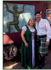
Top left: Kirkin' of the Tartan at St. Giles Presbyterian Church.