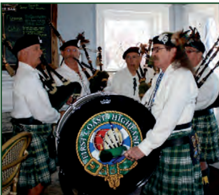
Bottom right: Performing at the 2017 Scottish Highland Games.