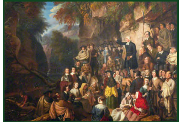
The Alexander Carse painting Covenanters in a Glen , showing an illegal conventicle.

Some scholars believe Marshall's inspiration for the service was not the Act of Proscription but the story of the Covenanters in Scotland during the 1660's and 1670's. During that time people attended secret outdoor services. The Covenanters posted armed look-outs at these meetings to warn of approaching government forces coming to break-up the meeting and arrest the participants.