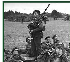
Bill Millin playing his bagpipes in 1944.

The most famous bagpiper of WWII is Bill Millin. He grew up in Scotland, and was a member and unit piper of No. 4 Commando. He was later appointed as the personal piper for his commanding officer, the 15th Lord Lovat, Simon Fraser. His unit took part in the D-Day landings in Normandy Landing 30 minutes behind the initial assault and under heavy fire, Lord Lovat asked Bill to play the troops ashore, and against regulations, he agreed. Bill was one of the first off the landing craft, his only weapon his sgian-dubh. The soldier next to him was killed almost as soon as the ramp came down. Bill waded through water 3 feet deep and then proceeded to march back and forth across the beach, three times, while under heavy fire, as the rest of the unit came ashore. He played “Highland Laddie,” “The Road to the Isles,” and “Blue Bonnets Over the Border.” A captured German gunner later said they didn’t shoot him because they thought he had gone mad.