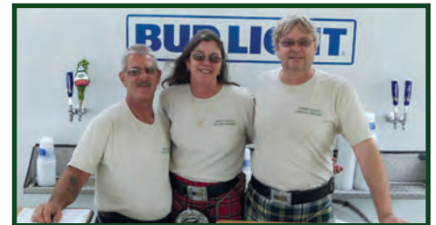
Serving up adult beverages at the Harry Potter Event at St. Francis Field.