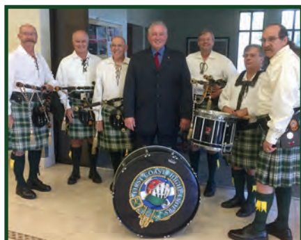
Turning Point at Calvary Church.

at Calvary Church in St Augustine where we support their memorial service. A barbecue chicken lunch was provided after.