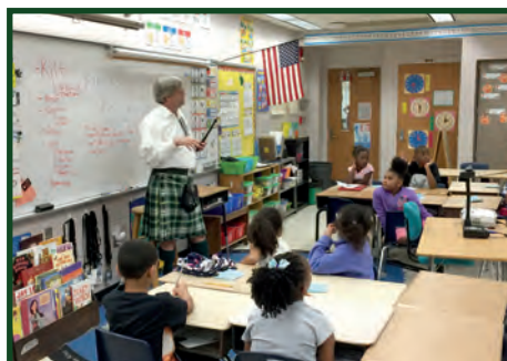
Time for some questions and answers at Chimney Lakes Elementary.